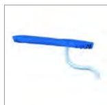
BF075 Aspirant Arm