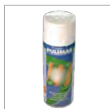
AR153 Faster spray 400ml