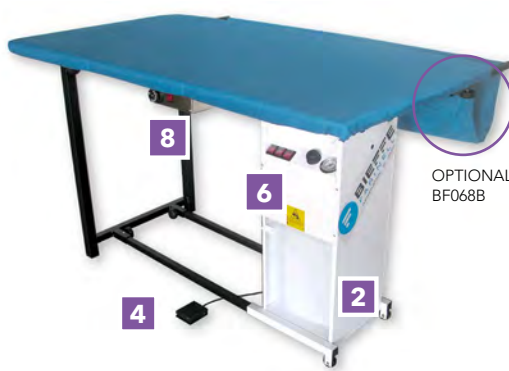
Models BF210, BF212, BF214 with board 151x81 cm