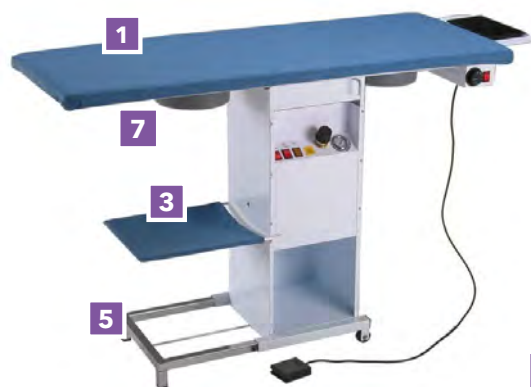
Models BF115, BF086, BF205 with board 143x51 cm

Ironing system composed of iron and rectangular ironing board