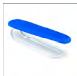
BF011 Sleeve Arm