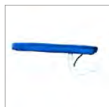
BF074 Heated suction bracket