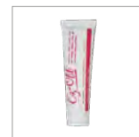
AR29 Cleanser paste